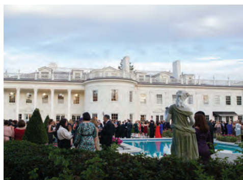
The Western White House