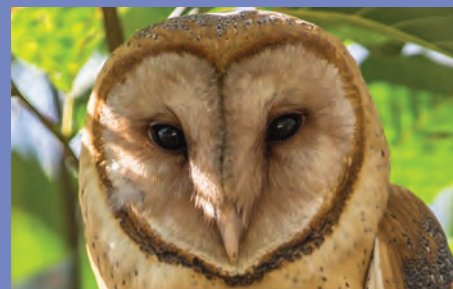
Photo of barn owl

This summer, CuriOdyssey received three female barn owls. These creatures have this name because they will often inhabit buildings, especially barns. This is no accident; barns happen to be very attractive spaces to occupy. There is typically an ample rodent supply inside these structures.